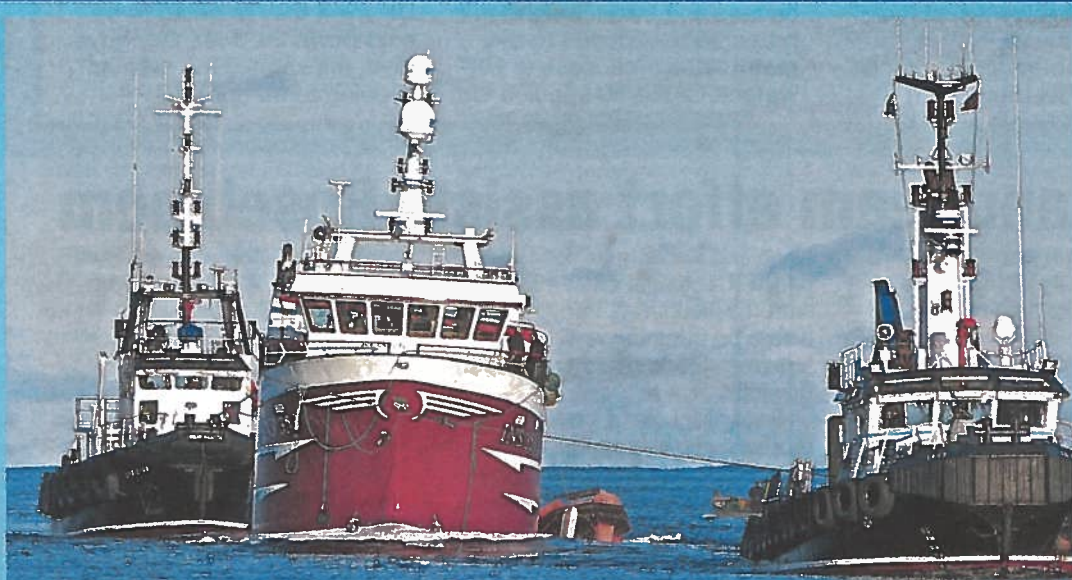
Rosebloom is towed into harbour by the Lerwick Port Authority vessels Knab and Kebister.