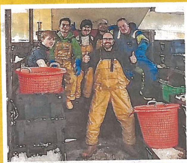
▲ The skipper and crew of Margaret of Ladram celebrating their record catch.

the massive financial investment put in from the vessel's owners at Greendale, to all my crew and shore support staff, as well as the team at Brixham who sold the fish for us to be able to break the record."